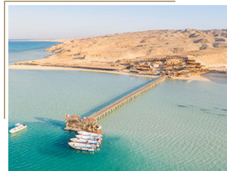
The Giftun Islands - National Park

*Please ask your Host or Reception for recommendations for the best tour providers and up to date prices.